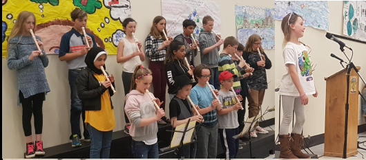
Concert / Talent Show