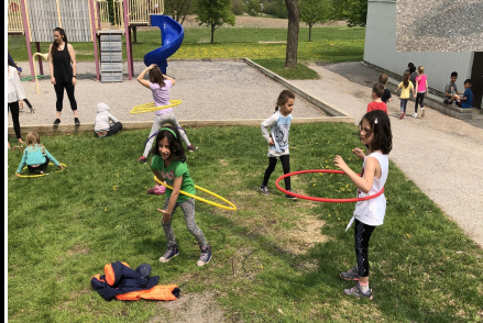
Jump Rope for Heart